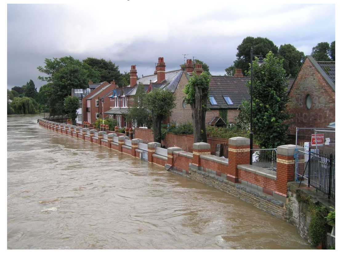
Figure 6.3 – Patio Based Feature