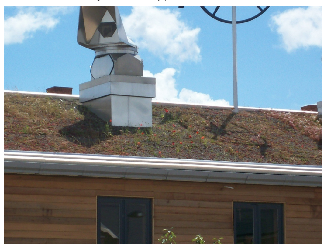
Figure 6.14 - Newly-planted Green Roof

6.53 This type of rainfall interception system is suitable for most locations where the only real consideration is whether the roof is positioned in the shade, hindering establishment of the grasses. As is reflected in the costing process, the unit area cost of installing a grassed roof increases as the area of roof increases. This is due to the weight of the roof increasing and requiring additional support or reinforcement. Similarly, the number of connection points with the gutter system would need to increase as the seepage rate of water in the grassed material is too slow to be accommodated by a normal bottom collector (such as a gutter) which would raise a risk of slumping of the saturated soil. Therefore, intermediate pick-up points for the drainage would be needed.