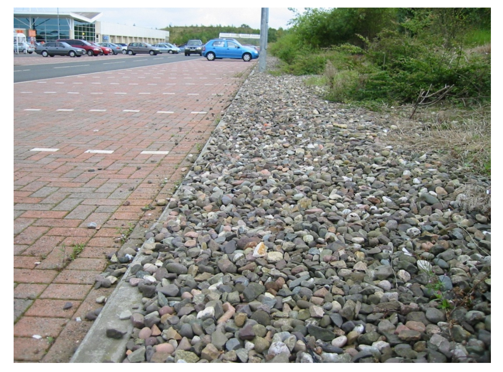
Figure 6.8 – Infiltration SuDS (Permeable Paving and Filter Strip)

the surface area of the site. A typical construction detail for a SUDS soakaway arrangement can be seen in figure 6.8 which demonstrates how run-off from permeable paving can be collected (in the gravel filters which can then be collected in a soakaway (unseen in this image), Other forms of soakaway include manhole chambers with permeable sides and bases where water collected from a surface water drainage network is allowed to seep into the surrounding soils in a controlled manner.