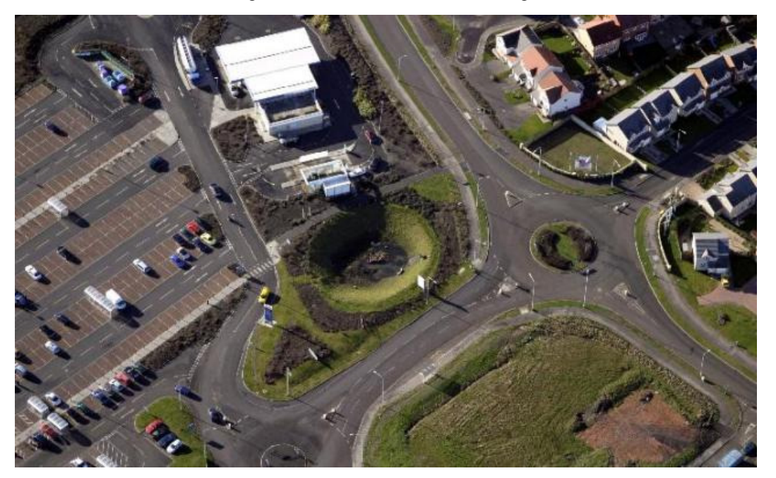
Figure 6.12 - Above Ground Storage

6.49 Above ground storage is affected by the same constraints as a swale. The main issue being that such a feature requires a large area in order to ensure that its capacity is sufficient for the surface area of the site. The ground must have low permeability, too, although a lining could be installed to prevent the storage area from draining.