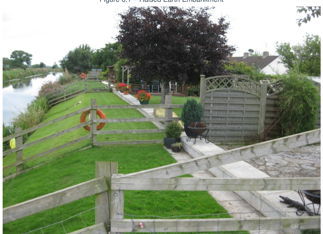
Figure 6.1 - Raised Earth Embankment