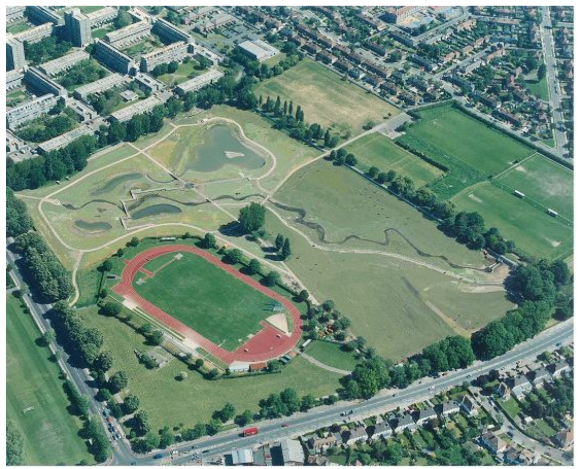
Figure 6.4 – Flood Storage Area – Upstream Storage

6.17 The FDA then needs to be installed in the original flood model to ensure that it achieves the desired effect, or to determine whether further modifications are required.