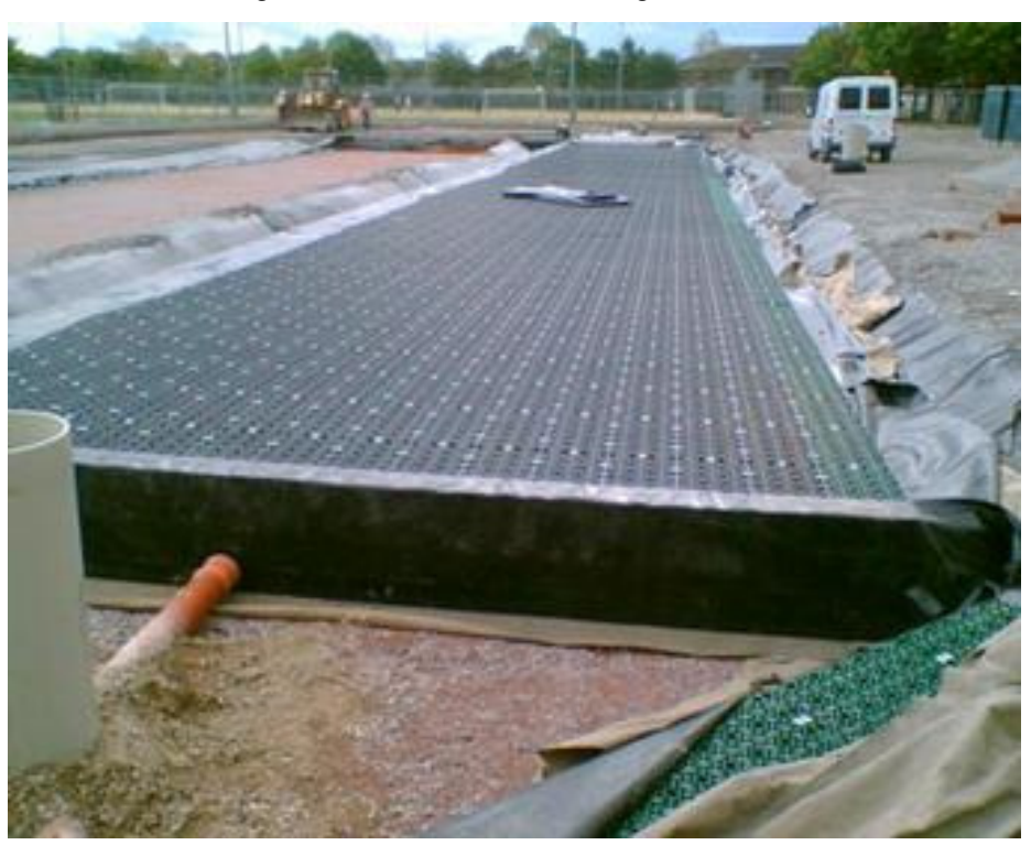
Figure 6.13 – Permeable Paving installation

6.51 As this feature works by infiltration, the same considerations should be given as with a filter bed or drain; whether the ground permeable enough, whether it contaminated (such as with ex-landfill sites or some brownfield sites); and whether the area of the development and its layout support use of permeable paving. A waterproof membrane can be installed so that water permeating through the permeable surface is collected and discharged into a nearby sewer or, with appropriate treatment, a watercourse.