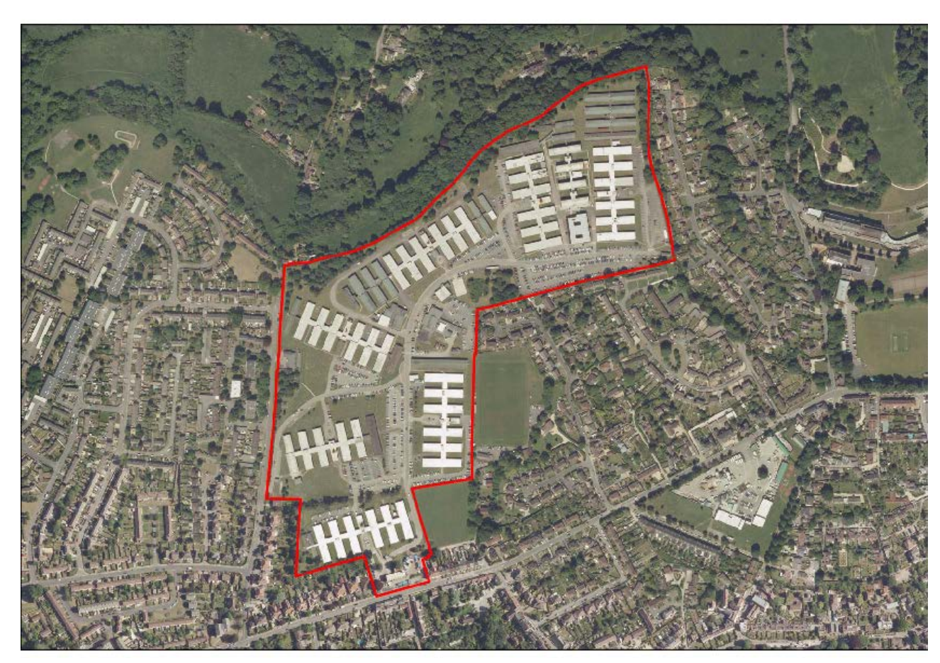
Figure 1 – Aerial photograph showing the site and its immediate context.

At present the site contains eight main buildings and a number of smaller buildings, together with circulation roads, car parking and grassed areas. The principal access is from Bradford Road, but there is also a secondary access from Foxhill.