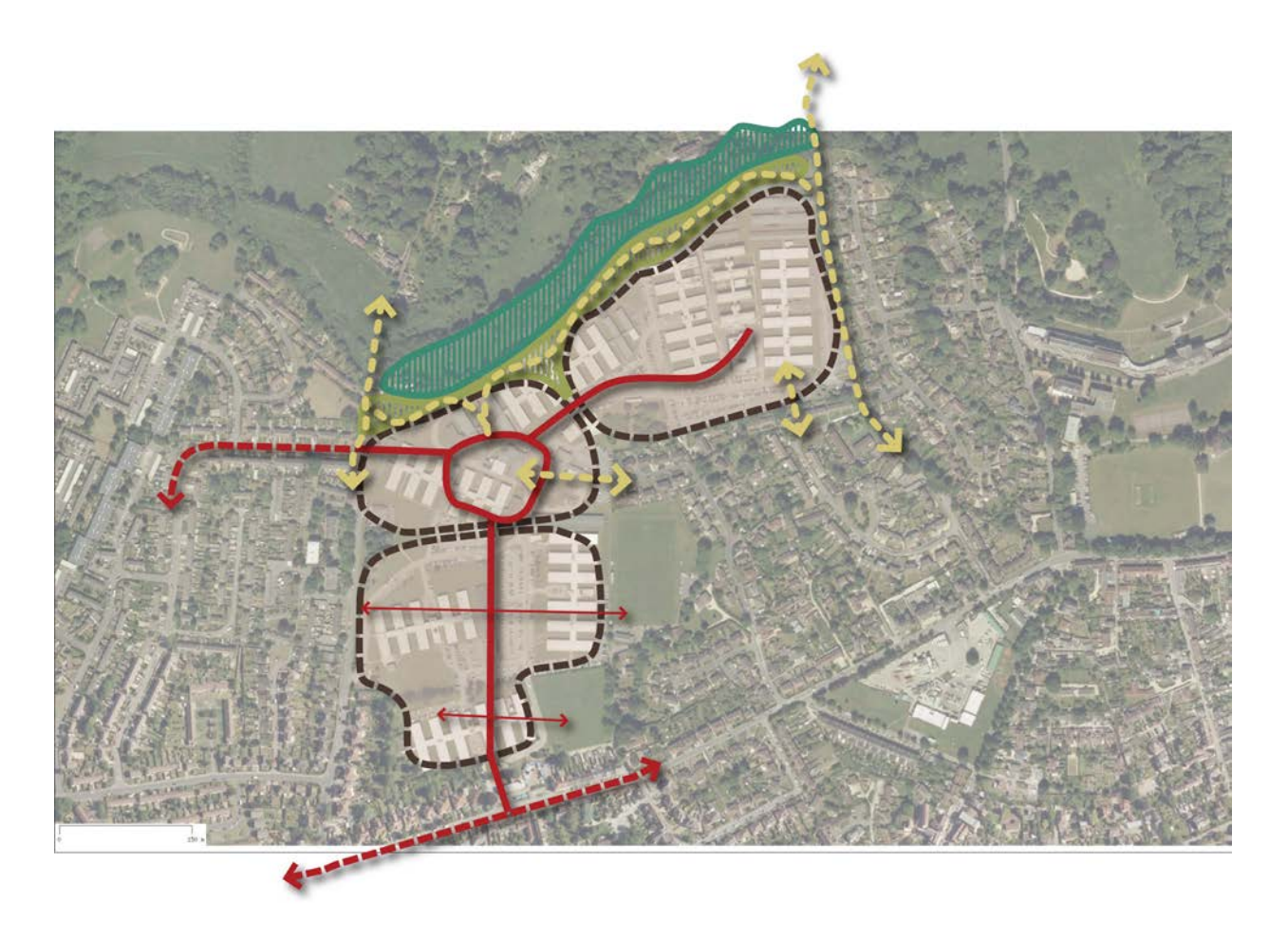
Figure 4 - Concept Plan - key to be added

To be read in conjunction with the B&NES Local Plan, Draft Core Strategy, other relevant planning policies and the evidence base