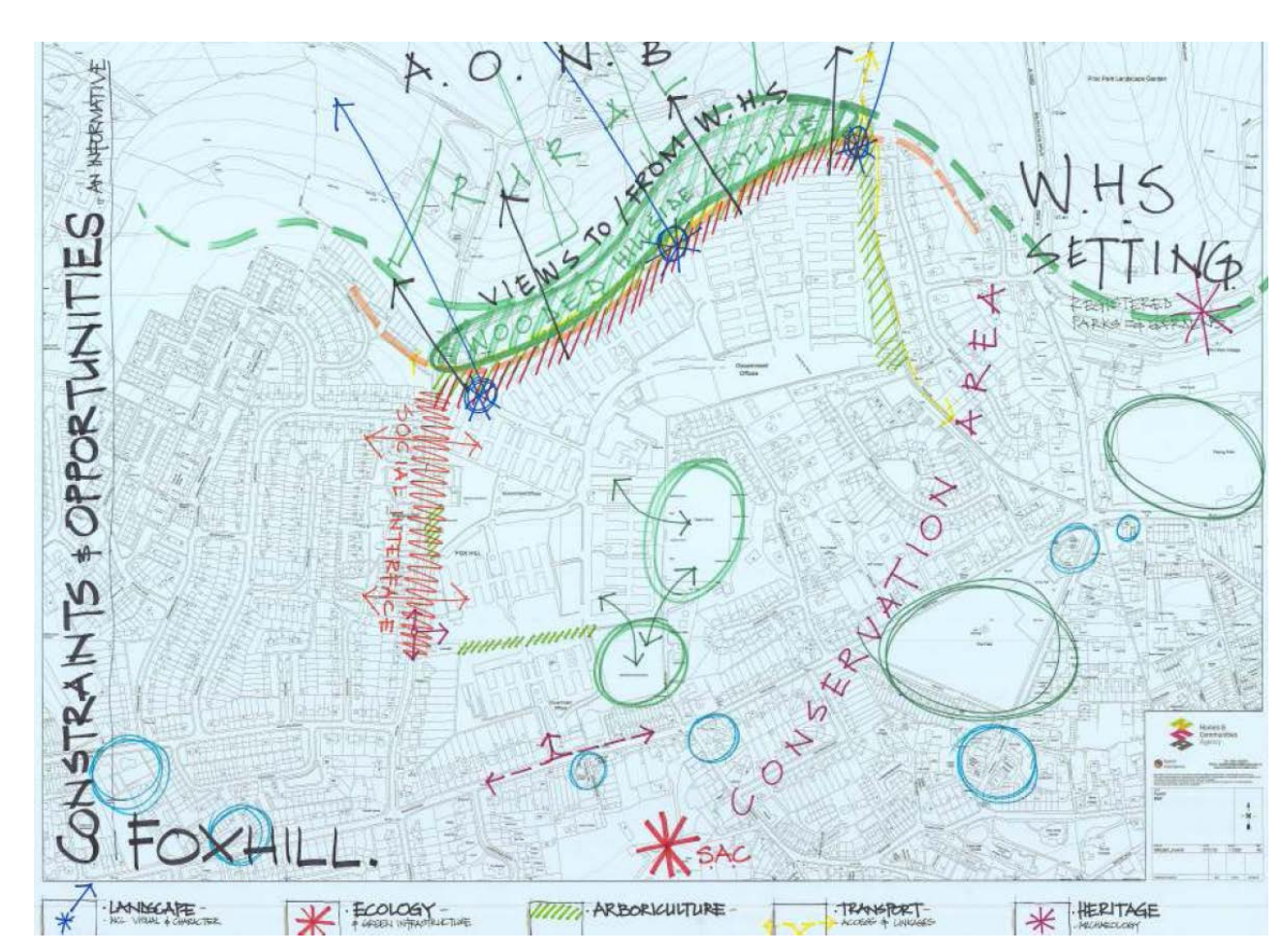
Figure 2 Initial analysis of key constraints and opportunities

The available evidence base which supports this analysis is found at <a href="https://www.bathnes.gov.uk/mod-conceptstatements">www.bathnes.gov.uk/mod-conceptstatements</a>