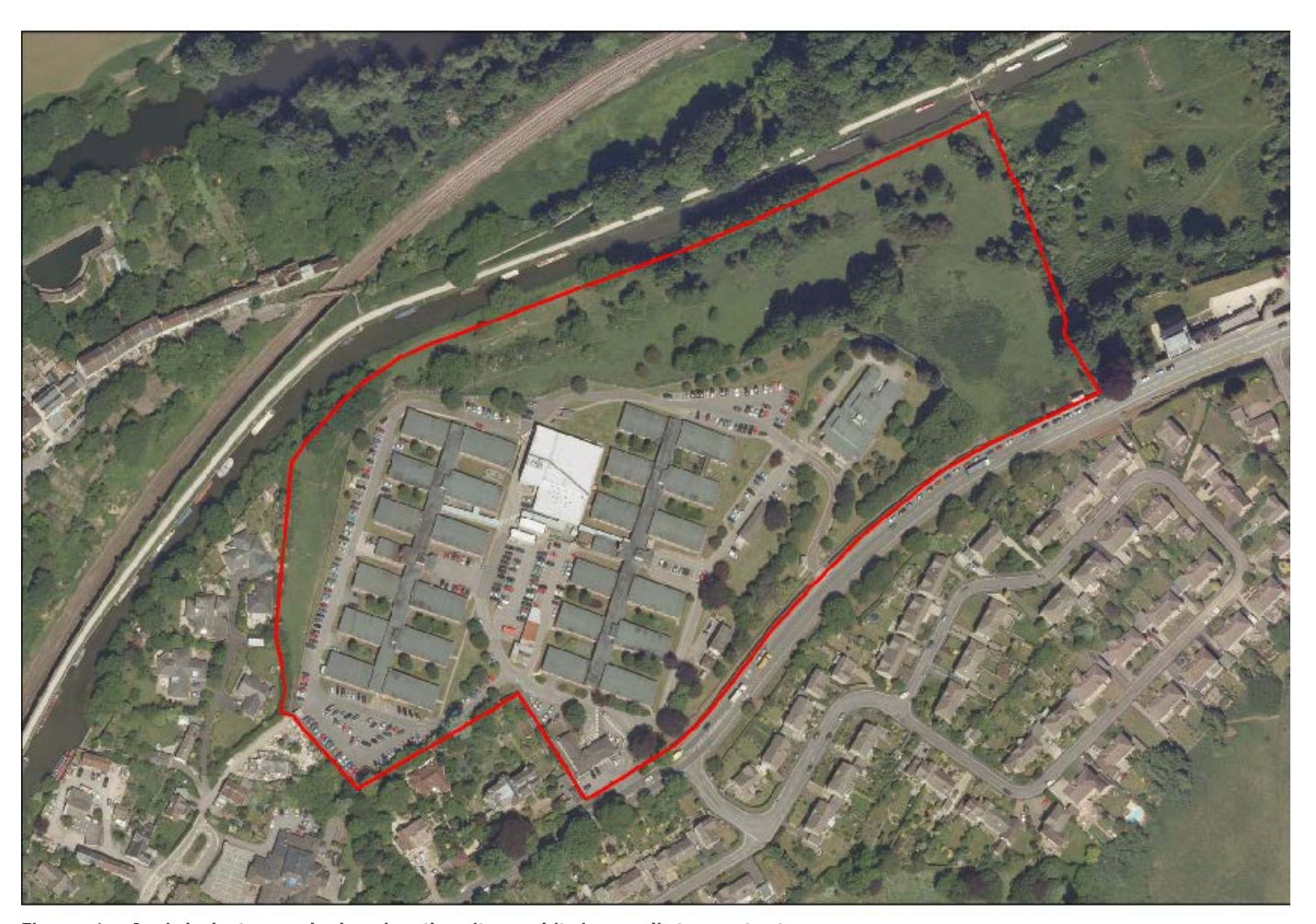
Figure 1 – Aerial photograph showing the site and its immediate context.

At present the site contains a number of single storey office blocks with associated vehicular circulation and parking, plus undeveloped natural areas to the north and east.