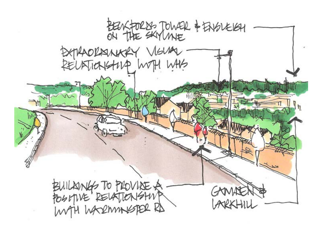
Figure 6 - Potential relationship with Warminster Road.