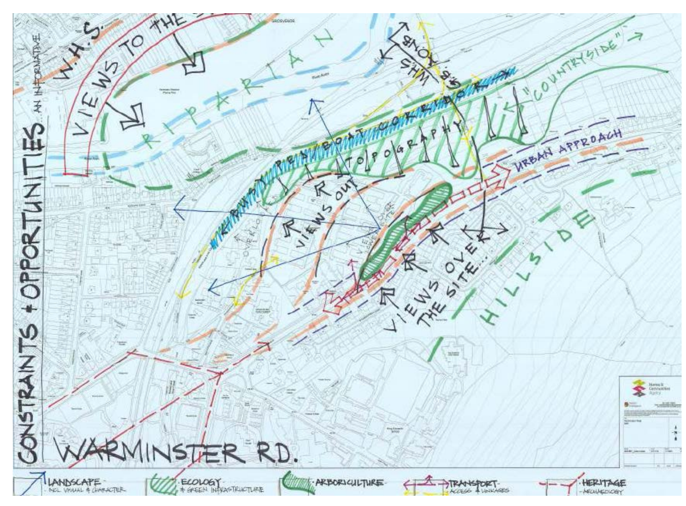
Figure 2: Intial analysis of key constraints and opportunities

The available evidence base which supports this analysis is found at <a href="https://www.bathnes.gov.uk/mod-conceptstatements">www.bathnes.gov.uk/mod-conceptstatements</a>