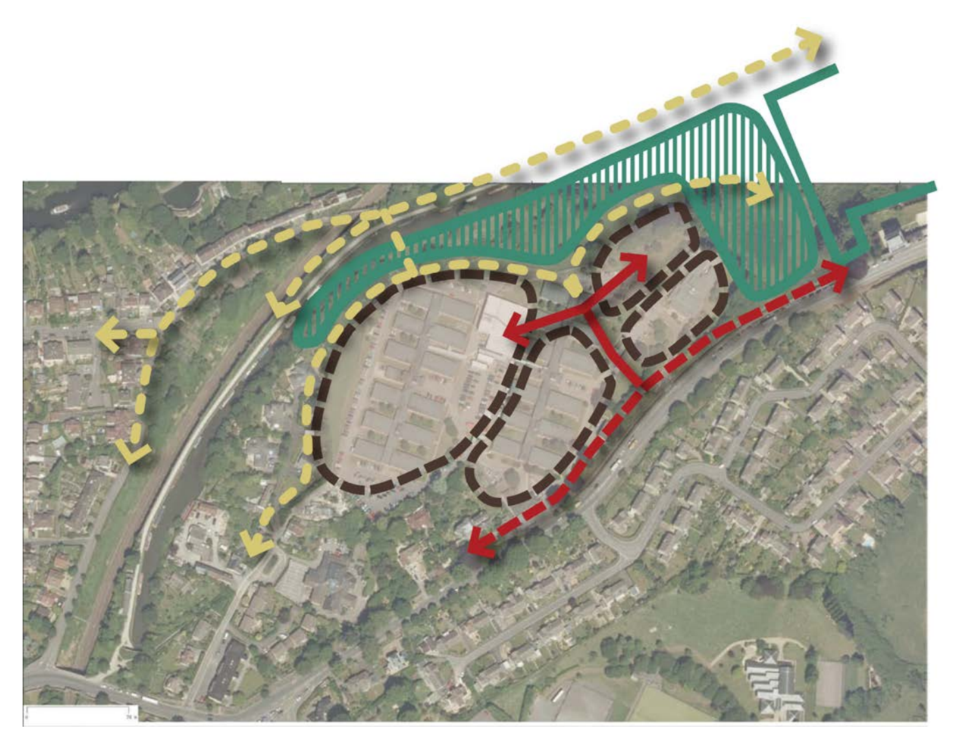
Figure 4 - Concept Plan

To be read in conjunction with the B&NES Local Plan, Draft Core Strategy, other relevant planning policies and the evidence base