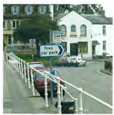
Consider further incentives to ease parking problems.

Depending on outcomes, work towards a decision on need for additional car park. The surfacing and landscaping of any new car park will need to be carefully and sympathetically considered.